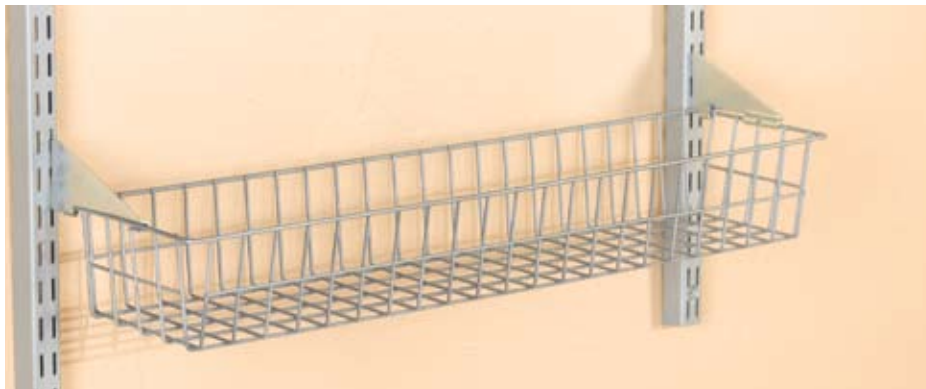
1615 – 31" Basket With Lock-On Brackets (For Use with Vertical Hang Rails) 1675 – 15" Basket With Lock-On Brackets (For Use with Vertical Hang Rails)