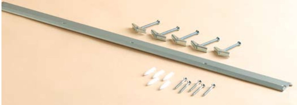
1600 – Top Track With All Mounting Hardware (for mounting to hollow, concrete or studded walls)