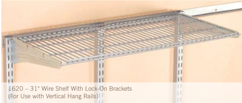
1620 – 31" Wire Shelf With Lock-On Brackets (For Use with Vertical Hang Rails)