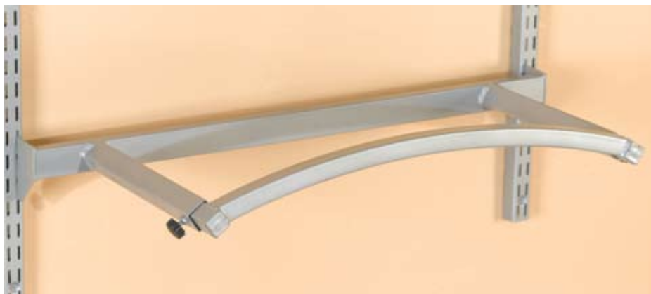
1625 – 31" Wide Adjustable Universal Storage Rack/Tire Holder Adjustable depth 13.75" to 23.5" (For Use with Vertical Hang Rails)