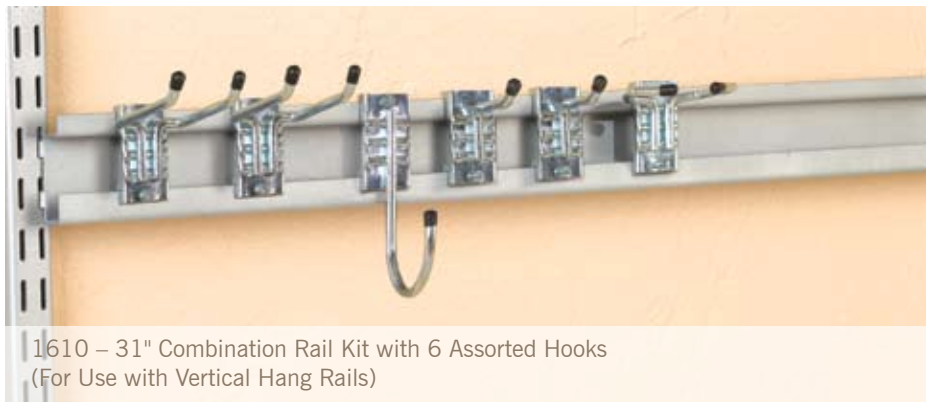
1610 – 31" Combination Rail Kit with 6 Assorted Hooks (For Use with Vertical Hang Rails)