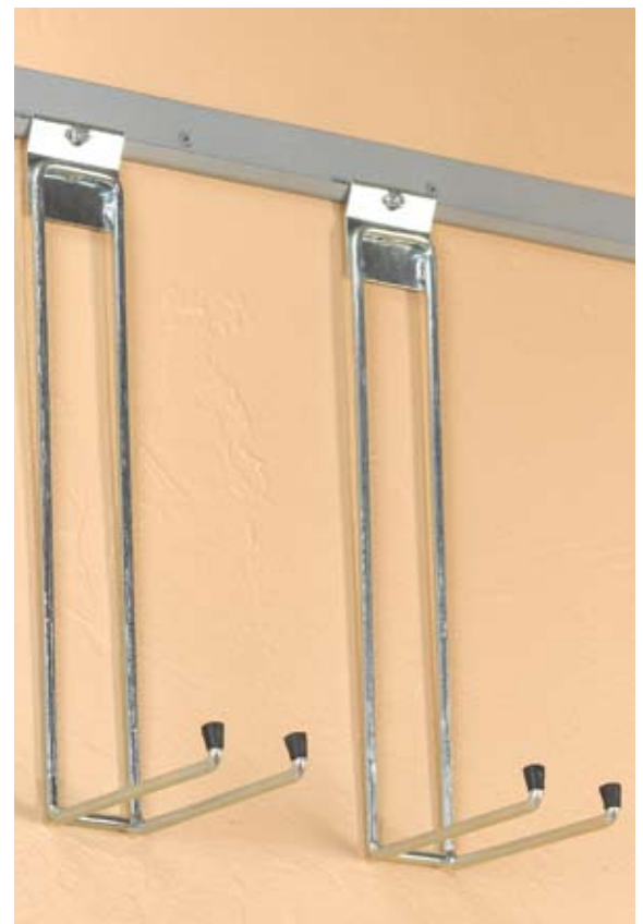
1638 – 2 Pack Large Tool Keepers (For Use with Top Track)

Storability Wall Storage Centers are built on 14 gauge, epoxy powder coated steel frames featuring remarkable holding strength and providing years of heavy-duty use.