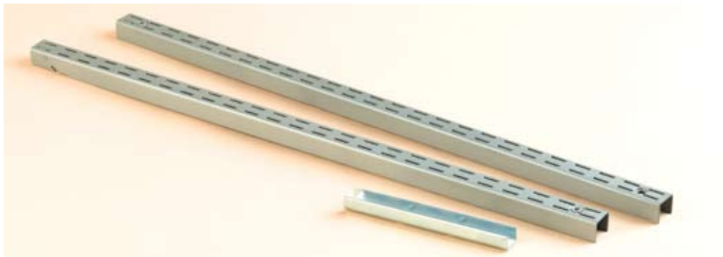
1601 – 3 Part Vertical Hang Rail With All Mounting Hardware