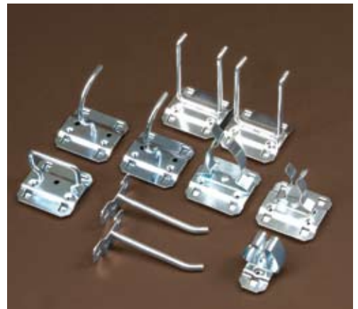
1635 – 10 Piece LocHook™ Assortment for Steel LocBoards™