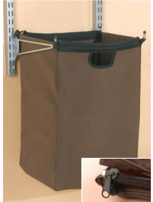
1604 – Zip & Carry Bag With Hang Bracket (For Use with Vertical Hang Rails)