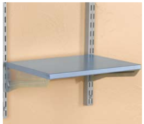
1680 – 15" Deep Shelf With Lock-On Brackets (For Use with Vertical Hang Rails)